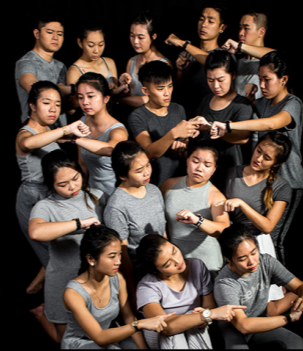
CHOREOGRAPHED BY PHAN YILIN