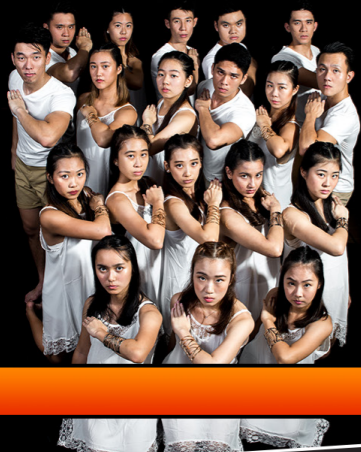
CHOREOGRAPHED BY SHERYL LIM