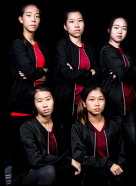
CHOREOGRAPHED BY GOH WEIZHANG