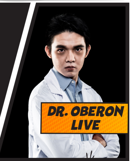
DR. OBERON LIVE